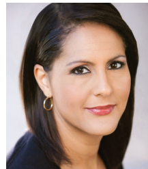
Karen Finney Democratic strategist and political commentator for CNN