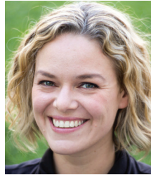
Katherine Maher Chief executive officer and executive director of the Wikimedia Foundation