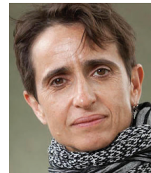
Masha Gessen Journalist at The New Yorker