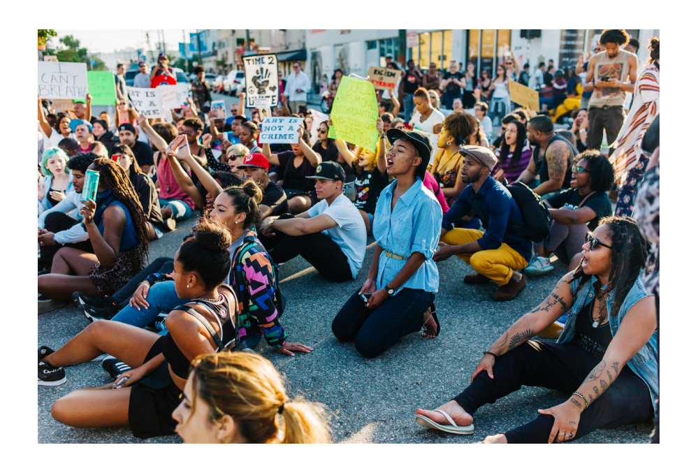
LEFT: Miami, USA - December 7, 2014: Protesters line the streets calling for justice for Michael Brown and Erica Garner.

successfully addressing the threat of political violence and doing so in a way that advances, rather than undermines, core democratic goals. The United States is at a moment that calls for such investment. As we move past the shorter-term risks posed by the 2020 election, we must now invest in building a more inclusive, more democratic, more peaceful society in the longer term.