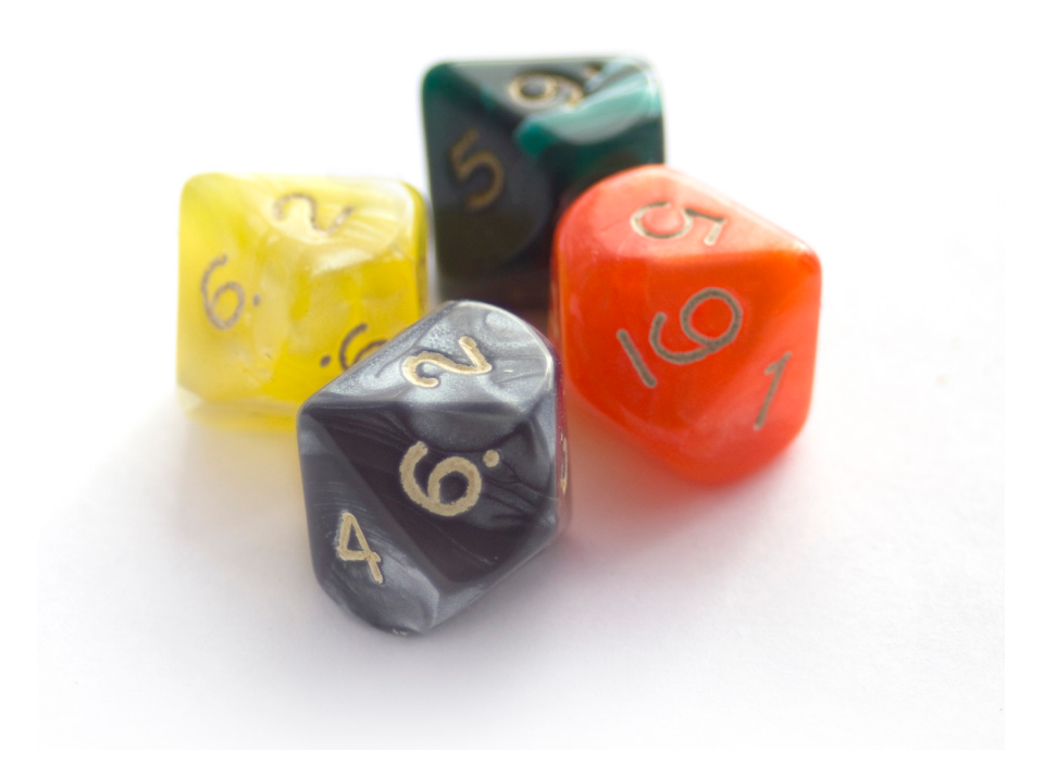
Ten-sided dice are often used to create a "seed" for the psuedorandom number generator.